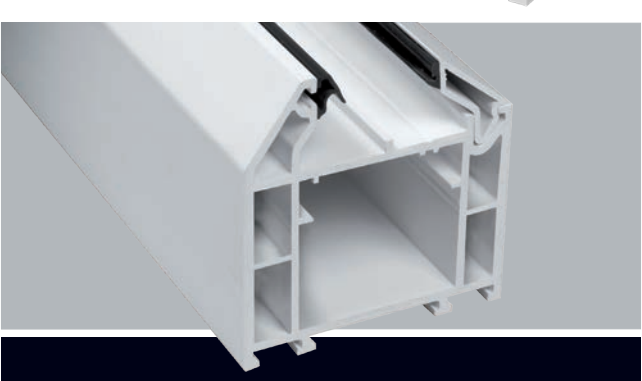
Soft line bevel feature is matched by the bead