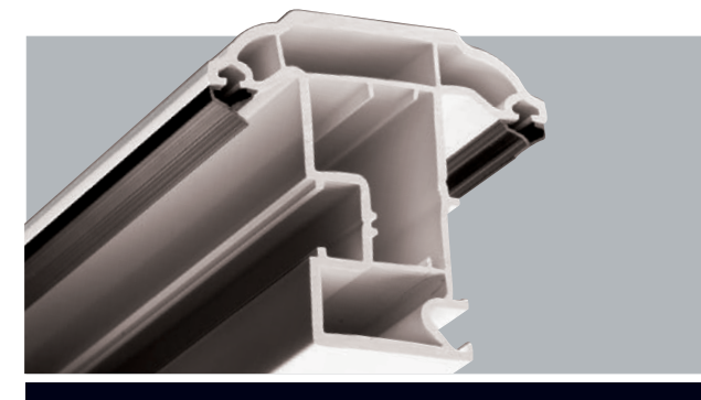
Full depth eurogroove for maximum hardware compatibility