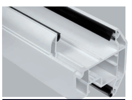
Unique patented knock-in bead system available with 28mm and 36mm putty line